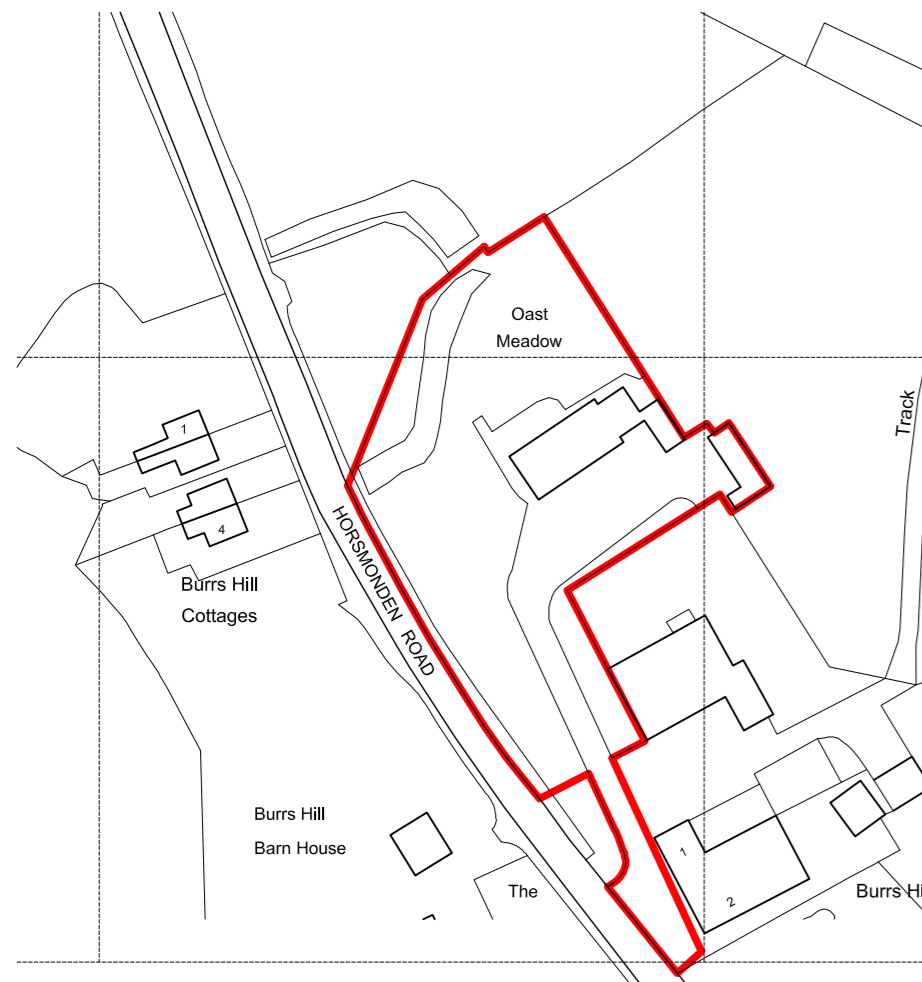
Location Plan (Scale: 1:1250)

0 10m 20 30 40 50 60 70 80 90 100m 1 : 1250