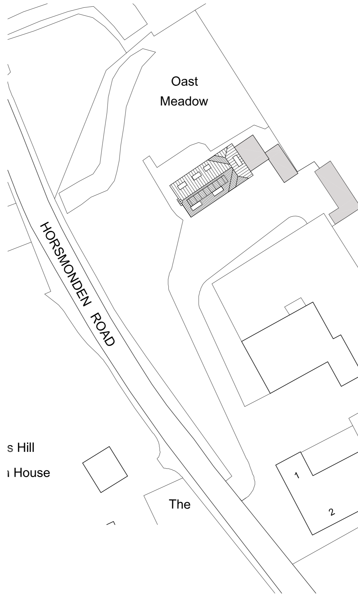
Existing Site Plan (Scale: 1:500)